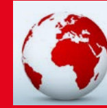
The worldwide available ULD

A new formulated ceramic coating topped the already excellent corrosion protection. Hence the PT9 NINETY withstands the extreme environmental conditions on sea even longer. Approved in long term testing and guaranteed by us.